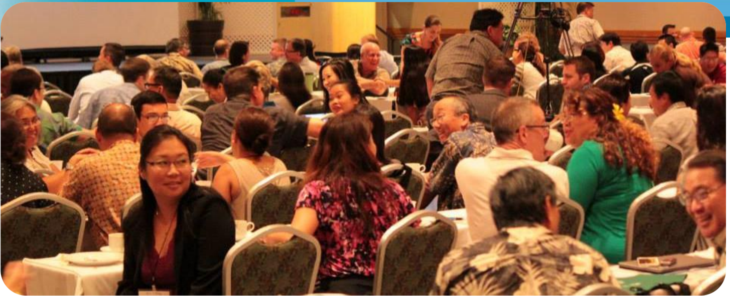
PDD 2014 – Networking!