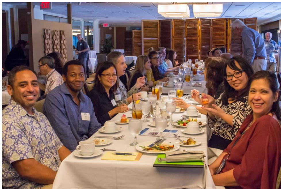
Attendees at our monthly lunch membership meetings